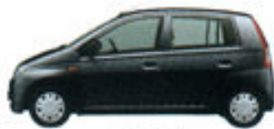
Black Mica (X05)