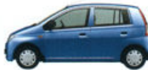
Blue Mica Metallic (B51)