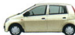
Champagne Metallic Opal (T17)