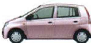
Rose Metallic Opal (R41)