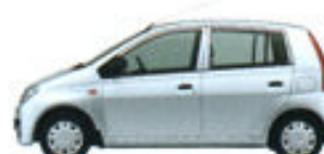
Silver Metallic (S28)