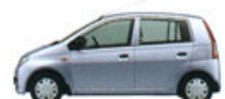
Lavender Metallic Opal (P10)